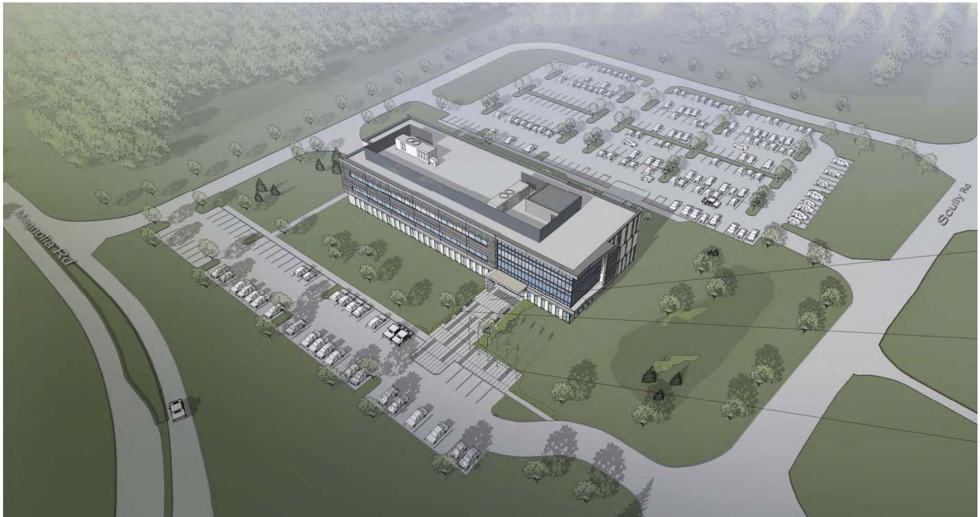
Corner of Magnolia and Skully Roads Edgewood Area